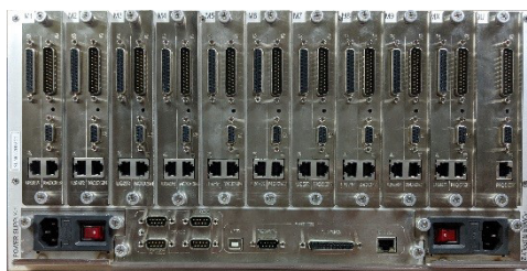
MS-10 Rear View