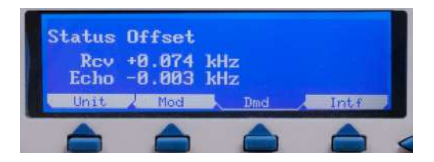
<Status: Offset – Rcv> Shows the far end carrier offset frequency being received. <Status: Offset – Echo> Shows the echo offset frequency being received.