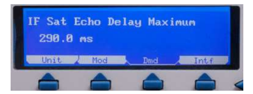
<Dmd: IF Sat Echo Delay Maximum – 2.0 to 320.0 ms > Sets the maximum satellite echo search delay. The recommended initial value is 290.0 ms.

<Dmd: IF Smart Carrier –Enabled> enables Smart Carrier operation.