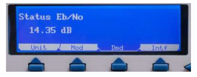
<Status: Eb/No – 30 to 0 dB> Shows real-time Eb/No level of the far end carrier being received when the demod is locked.