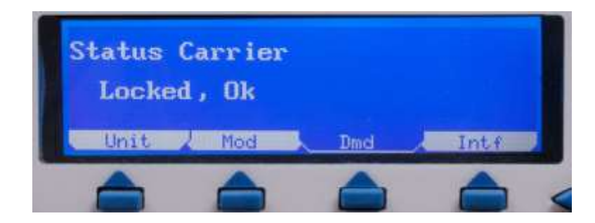
<Status: Carrier – Locked, OK> Shows far end Carrier Locked and Normal.