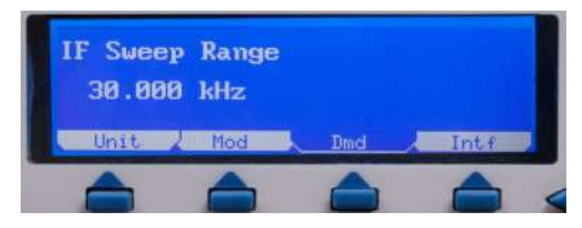
<Dmd: IF Sweep Range – 0.100 kHz to 3.250 MHz> Sets the +/- carrier frequency acquisition sweep range.

<Dmd: IF Sat Echo Delay Search Hold – 0.0 to 600.0 Sec > Sets the amount of time a narrow +/-1 ms delay search hold is active until returning to the full delay sweep range set by "IF Sat Echo Delay Maximum" and "IF Sat Echo Delay Minimum" after echo lock is lost. This speeds echo reacquisition when brief interruptions occur.